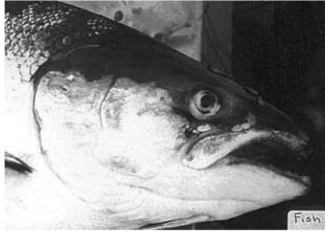
Figure 2: The range in occurrence of number of spots on the operculum of Atlantic salmon Salmo salar caught in Pacific Management Area 12 in 2000. The left photograph is a well-spotted Atlantic salmon from Queen Charlotte Sound, portraying typical coloration for this species. The right photograph is one of the 53 Atlantic salmon with no spots caught in Tribune Channel.